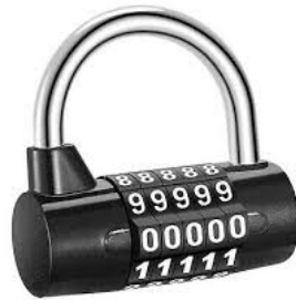
A 5-digit combination lock

Once there was a combination lock, which consisted of m rings with digits from 0 to 9. It was broken so one could never open the lock no matter how he spun it. Alice and Bob wanted to play a game with it. They in turn spun one ring of the lock for one step in either direction, and tried to open the lock (although they knew the lock would never open). If the password on the lock had already been tried, the player would be considered lost. Additionally, they had discussed a set S of n passwords before the game started. The player would also lose if (s)he tried a password among S . Alice would move first.